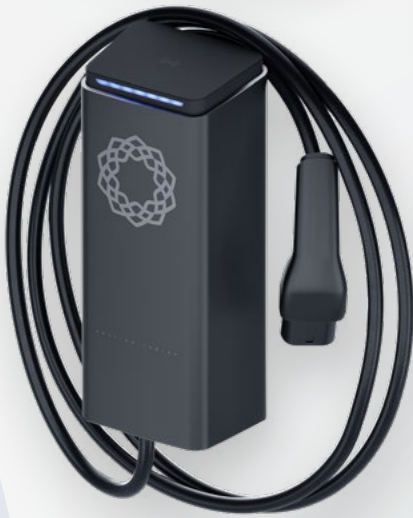
LUMINA SOCKET PREMIUM