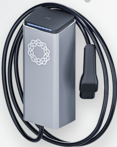
LUMINA SOCKET PREMIUM